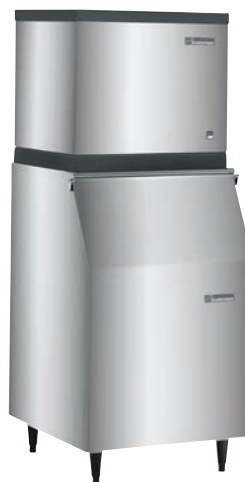
SCOTSMAN ICE SYSTEMS CME 506