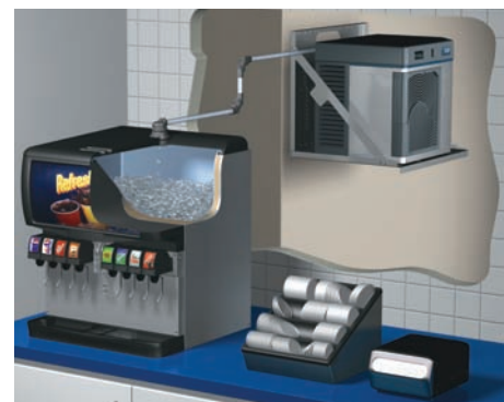
FOLLETT Horizon Chewblet